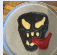
Weston Tysoe (7P)